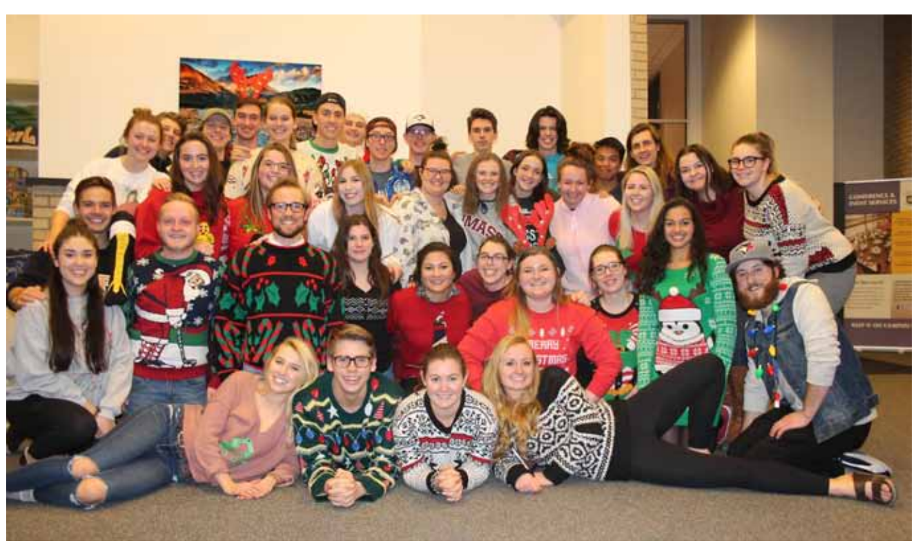
ORS -Christmas Photo

Along with these recurring fan-favourite events, we also introduced events bringing residents to the Roundtable Board Game Café, True North axe throwing and Get Air Trampoline Park. Dog walking was introduced as a weekly trip to help out the Prairie Pitbull Rescue take foster animals on walks. Since it started in the second semester, every spot was filled each week, and lead to some very happy puppies (and students)! Fiat Stache, our annual fundraiser for below-the-belt cancer, grew its total donation amount for the second consecutive year. A new fund-